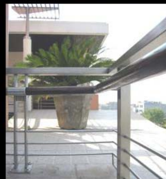
*ARJUN ROSHA, AT SICA.